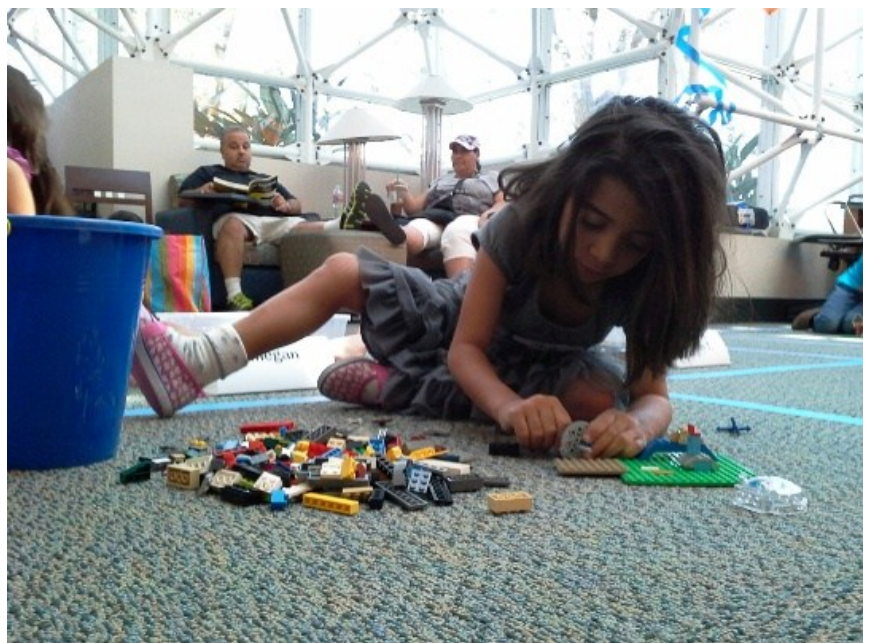
Lego master builder at work