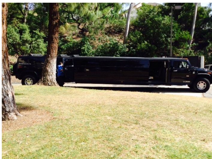
White Rose Limousine Company