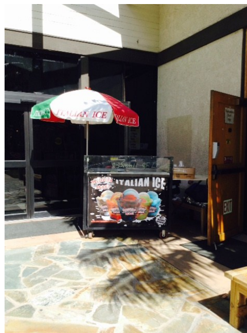
Moustache Mike's Italian Ice